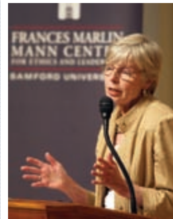
Eleanor Clift speaks at Samford.