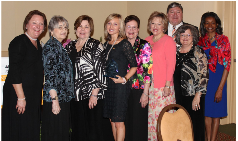
Stripling with IVMSON faculty and alumni at the banquet