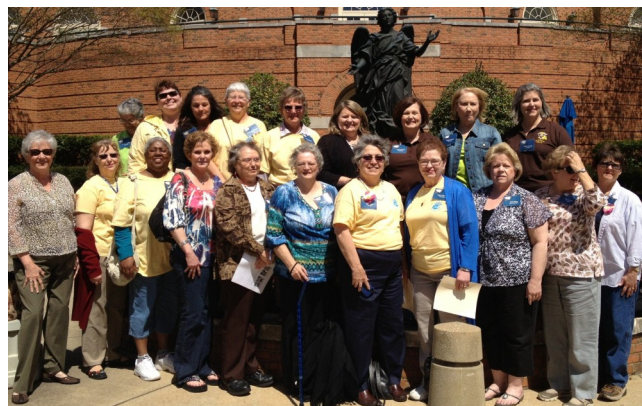
BNF Nurses during their campus visit