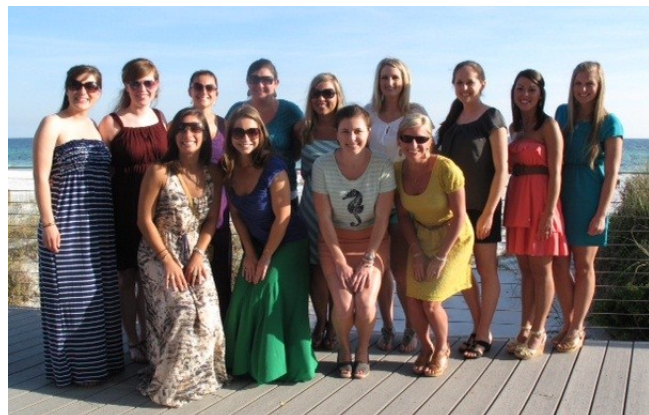
Nurse anesthesia students from the classes of 2014 and 2015

On April 26, sixty-eight alumni, faculty, and students celebrated the 10 th Anniversary of the reopening of the nurse anesthesia program at Samford University. The reception was held at the Sandestin Hilton in conjunction with the Alabama Association of Nurse Anesthetists (ALANA) Spring Meeting. It was great to see graduates from the Birmingham Baptist program as well as graduates representing many different classes. Items were sold to raise money for students travelling to professional meetings and for medical missions. "Save the date" cards were also distributed for the February 2014 Continuing Education Seminar.