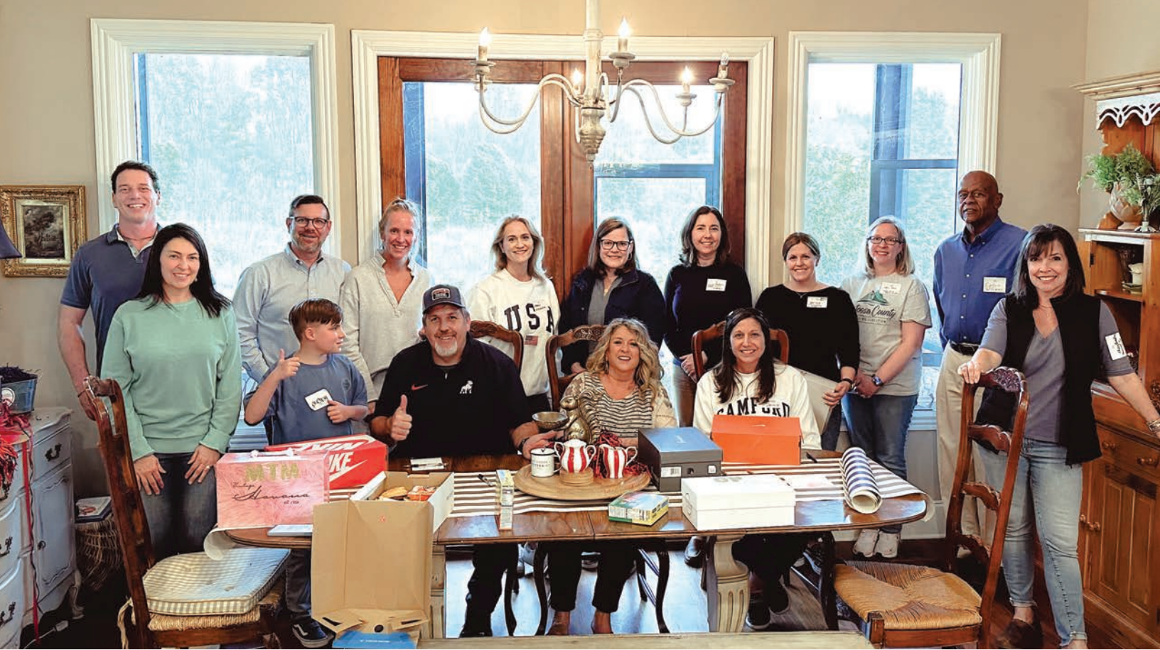
Parents in Chattanooga fellowship and work together to encourage students with exam care packages.