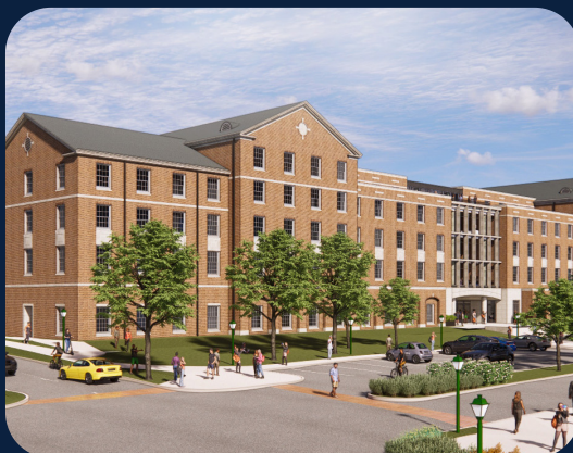
RESIDENCE HALLS AND PARKING