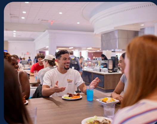
RENOVATED UNIVERSITY CAFETERIA