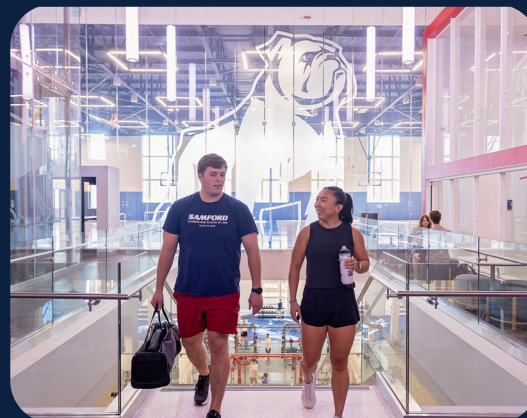
CAMPUS RECREATION, WELLNESS & ATHLETIC COMPLEX