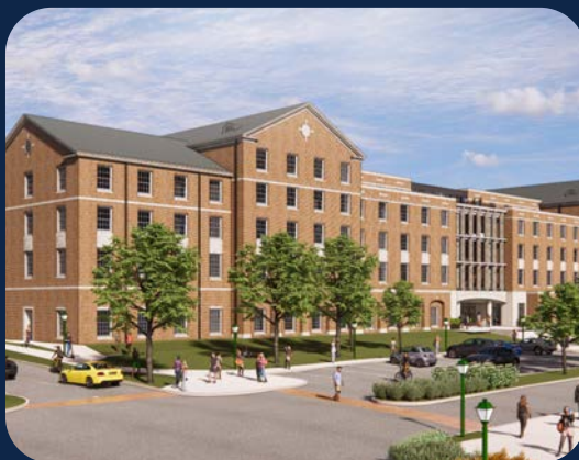
RESIDENCE HALLS AND PARKING