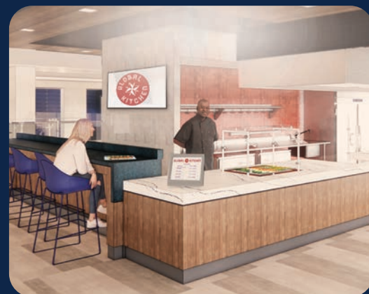
RENOVATED UNIVERSITY CAFETERIA