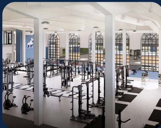
CAMPUS RECREATION, WELLNESS & ATHLETIC COMPLEX