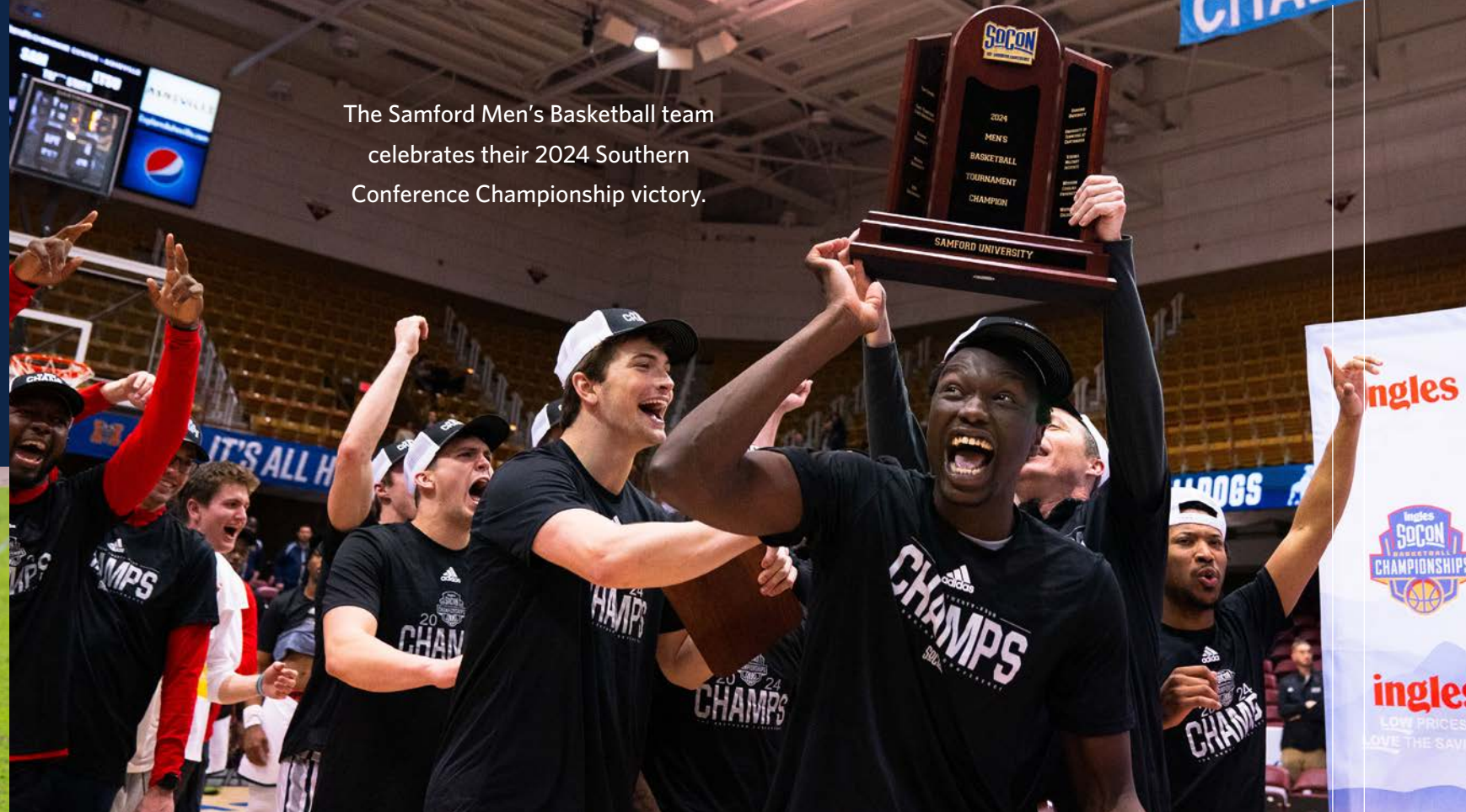
The Samford Men's Basketball team celebrates their 2024 Southern Conference Championship victory.