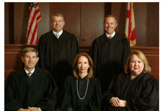
The Alabama Supreme Court (top) and the Alabama Court of Criminal Appeals (bottom) will have oral appellate arguments on campus in November.

Get Connected to Cumberland School of Law for all the latest updates.