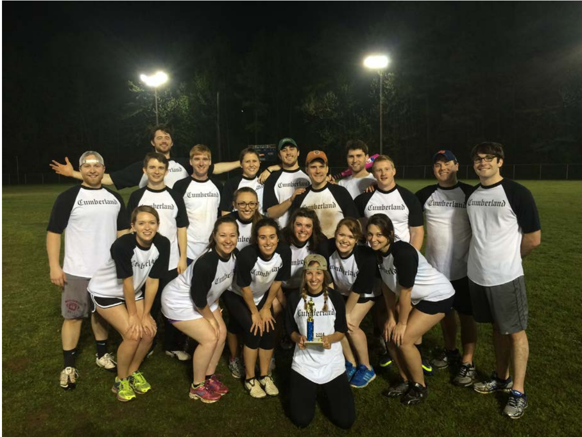
Law Review remains the reigning champion of the Annual Law Review vs. Trial Journal Kickball Game.