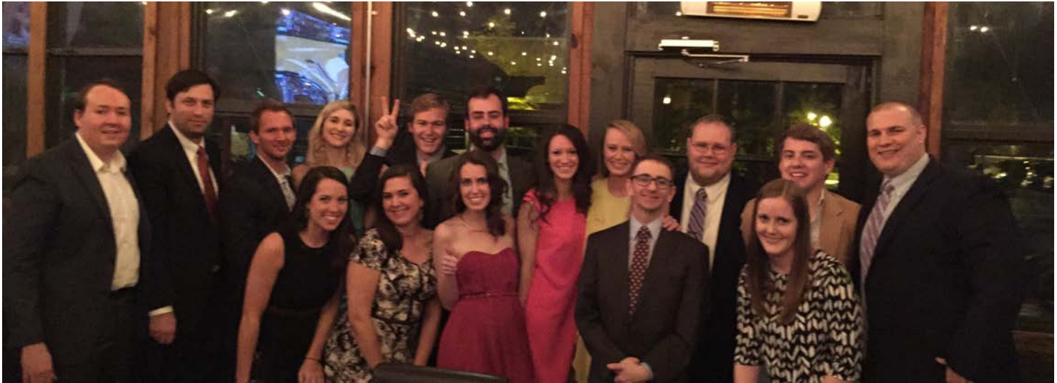
Members of The American Journal of Trial Advocacy celebrate the end of the academic year at their banquet on April 23.