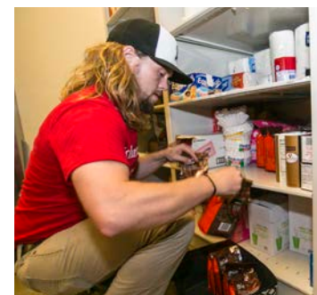
Top: Members from the Class of 2018 pose before beginning volunteer work. Above: Students volunteer at Ronald McDonald House as part of the Public Interest Day of Service. Students served various organizations throughout Birmingham including, Turkey Creek, Ronald McDonald House, Easter Seals of AL, Pathways Women's Shelter, Grace House Ministries, Red Mountain State Park and Children's Village.

Get Connected to Cumberland School of Law for all the latest updates.