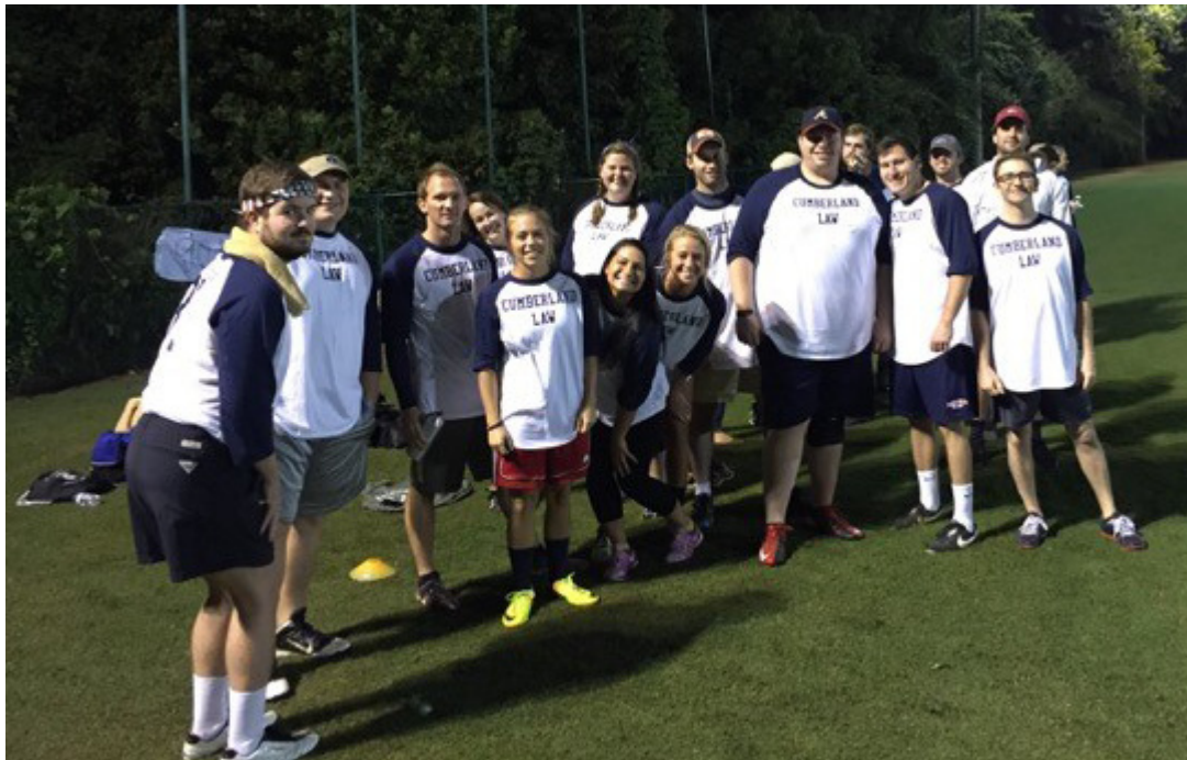
Cumberland literally kicked off Pro Bono Month with a kickball tournament with the Alabama School of Law and Jones Law.