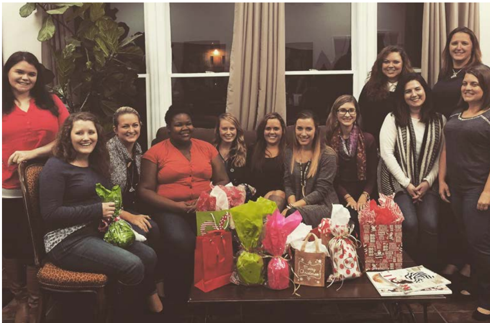
Members of Cumberland's Women in Law organization celebrated at a recent Christmas Party. The organization is currently collecting canned food donations to help feed the homeless during the holidays. See page 6 for more information.