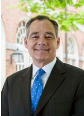
PHOTO OF THE WEEK