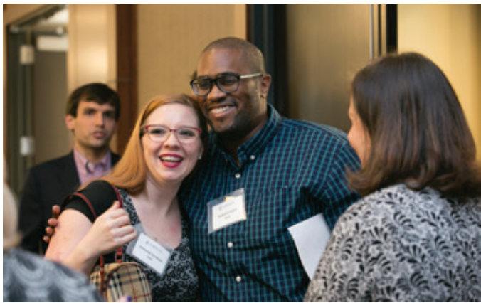
Cumberland alumni enjoying camaraderie prior to lunch at the annual Birmingham Alumni Luncheon on January 20