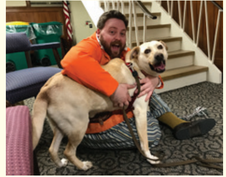
Pictured: Shakespearean Actor and Buddy

➤ The ASC tour at Cumberland included the presentations of Romeo & Juliet and The Two Gentlemen of Verona. For the performance of Two Gentlemen the ASC partnered with a local animal shelter to showcase an adoptable dog in the role of “Crab” and encouraged audience members to adopt Crab (a.k.a. “Buddy”) after the show.