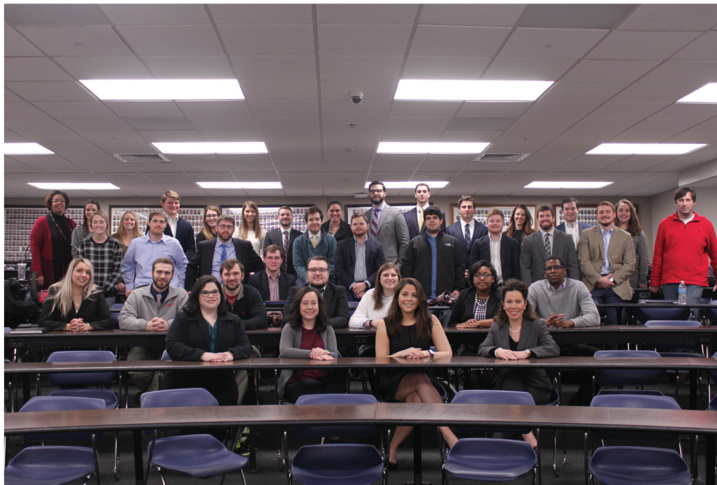
2018 Mini-Term Students at the Negotiation Workshop