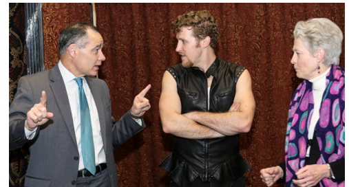
Guests of the February 15 matinee participate in a Talk Back session with the actors of “Hamlet.”