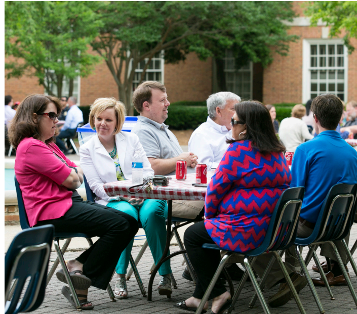
Samford employees enjoy the staff picnic May 21 in Ben Brown Plaza.

He said Cumberland lawyers are relentless, they know life outside the law, they take themselves just seriously enough, they are loyal and they are in the people business. These traits "make us who we are," he told the graduates. "I hope you can see them in yourself as well, and draw upon them as you start your legal career." ■