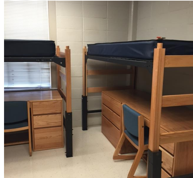
Collegiate Bed Loft - pre-Move In Do It Yourself - during Move In