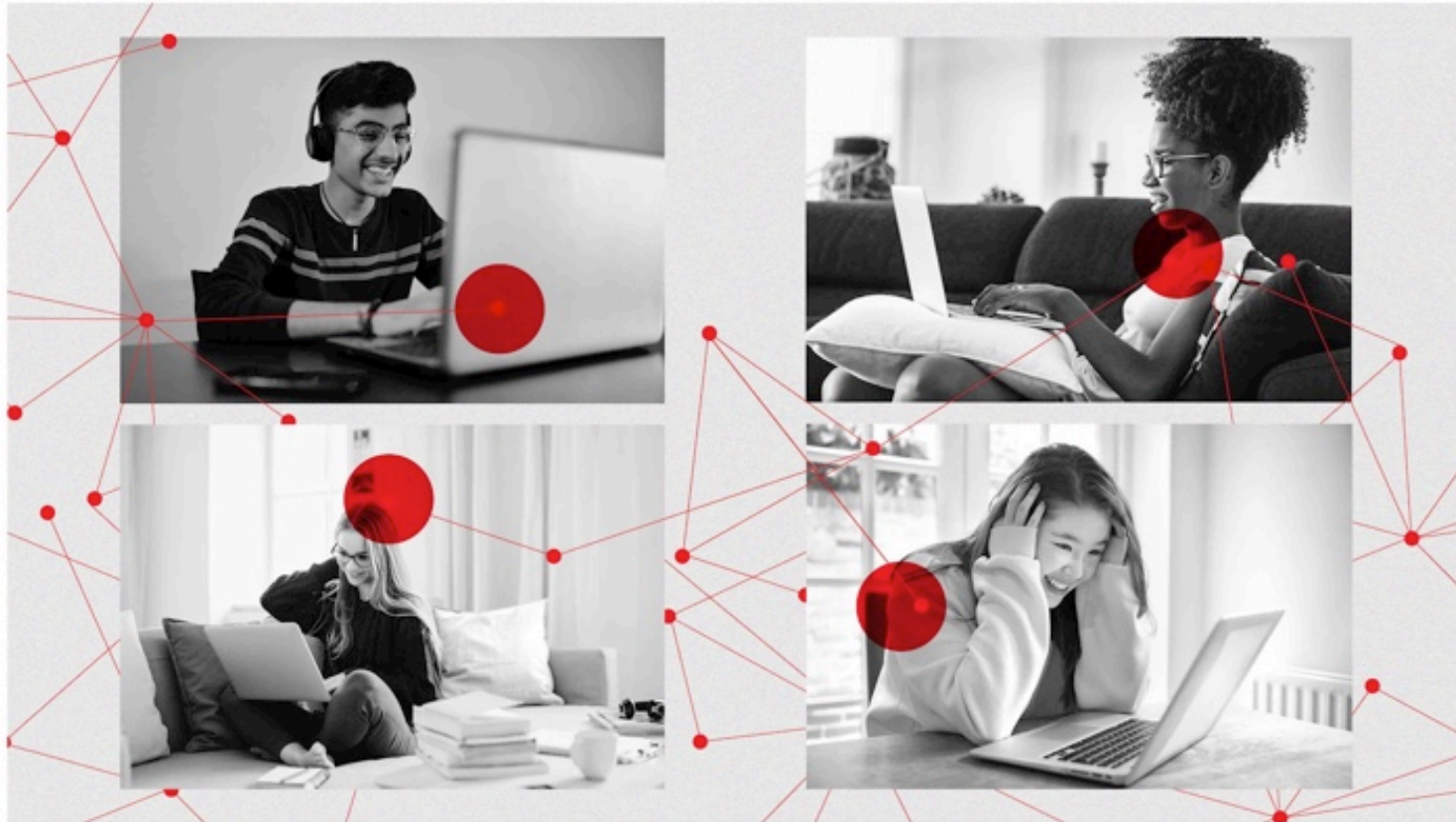
Image: Illustration by Mallory Rentsch