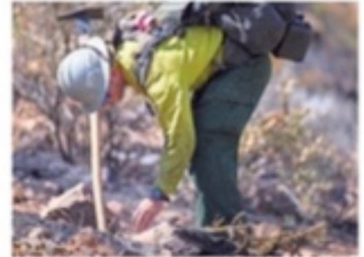
A U.S. Forest Service hotshot works near the East Desert Fire on May 18 in Cave Creek.