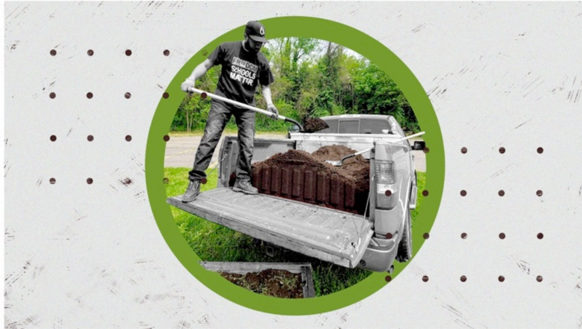
Image: Illustration by Mallory Rentsch

S ome would have seen nothing but a lawn around the black Baptist church in Baltimore, but pastor Heber Brown III had a grander vision—a garden space to minister to people’s physical hunger.