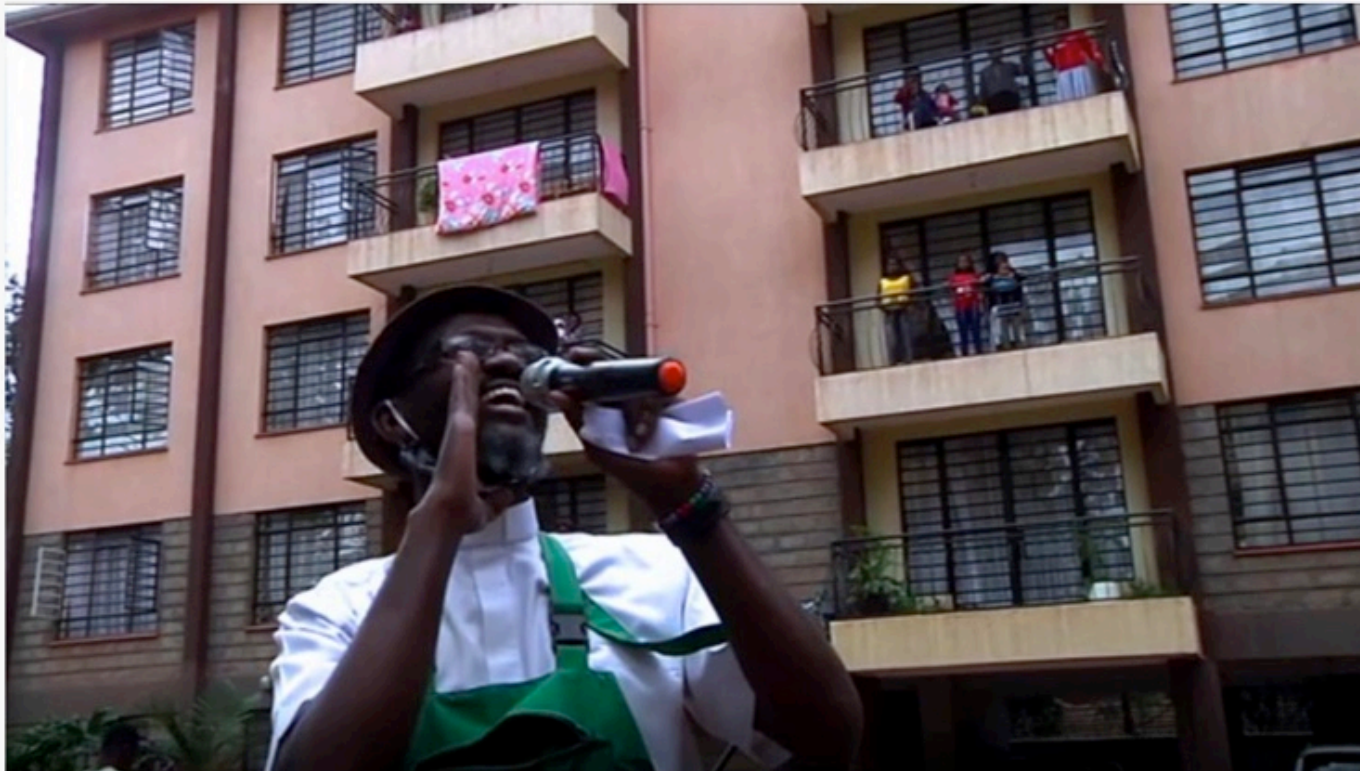
The All Saints' Cathedral mobile church in Kenya